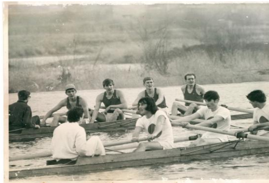
[Above] Same crew after the boat race with losers York in the foreground!