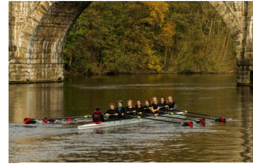
Grainger Crew during their first race